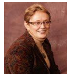
K.C. Snider Illustrator

http://www.thegoldenpathway.blogspot.com